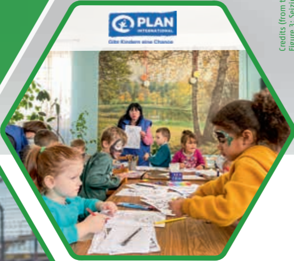
Credits (from top): Figures 1 & 2: Witters GmbH; Figure 3: Seizinger; Figure 4: Plan International